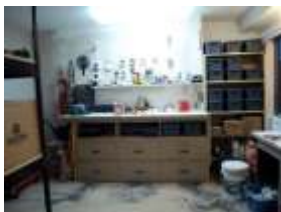
Workshop in Basement

Powder room and Rec Room Walk-out basement