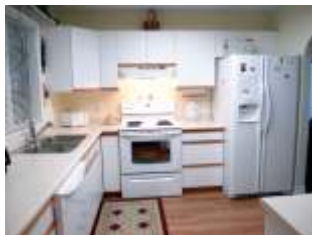
Cheerful and Efficient Kitchen

Neighborhood: Vernon - Westmount Priced at: $259,900 Taxes: $1,639 (2008) Year Built: 1990 (approx.) Bedrooms: 2 Baths: 2.5 Strata Fees: $ Zoning: RM2 Total Living area: 1,485 Sq. Ft.(approx.) MLS # 9209109